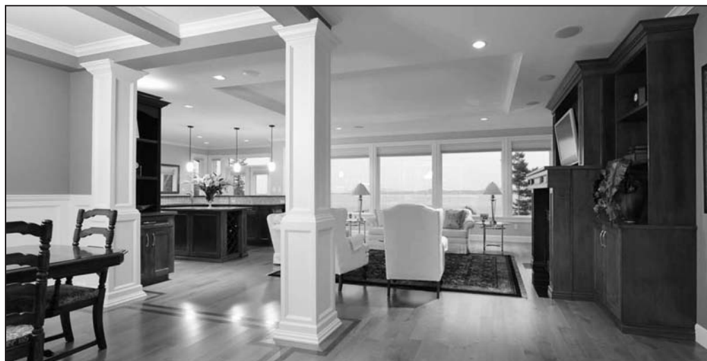
The award winning work of Rayn Properties Ltd.

Silver CARE award for best custom home 3,000 – 4,000 square feet and once again the biggest challenge was in the lot that offered a phenomenal ocean view and required a great deal of engineering work to create the type of home the owner wanted.